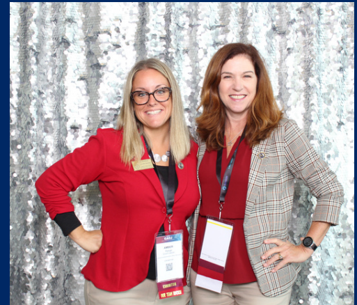
Having a little fun at the CACJ Photo Booth!